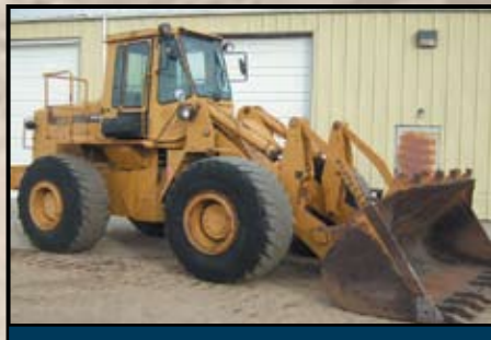
FIAT ALLIS FR15B WHEEL LOADER