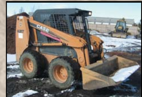
2001 CASE 60XT SKID STEER LOADER

2001 Sterling Crane Truck w/ Manitowoc Mod. M2892S Boom, s/n 44603, 28-Ton Capacity, 92' Stick, 3-Section Boom, Cat 3126, 15-Spd, 134K Miles, T/A, Front & Back Outriggers Grove RT60S Rough Terrain Crane, 18-Ton Capacity, Detroit Diesel, Outriggers, 20.5-R25 Tires, s/n 19165 Lorain LRC180 Mobile Crane, 18-Ton Capacity, s/n 79414