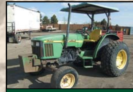
JOHN DEERE 5310 TRACTOR