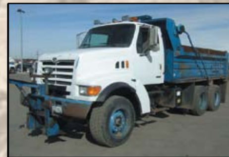
2000 STERLING LT9500 DUMP TRUCK W/ CUMMINS M11 PLUS