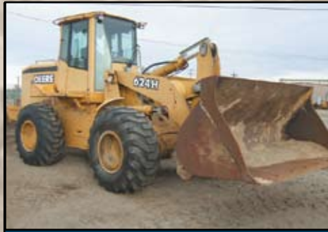
1998 JOHN DEERE 624H WHEEL LOADER