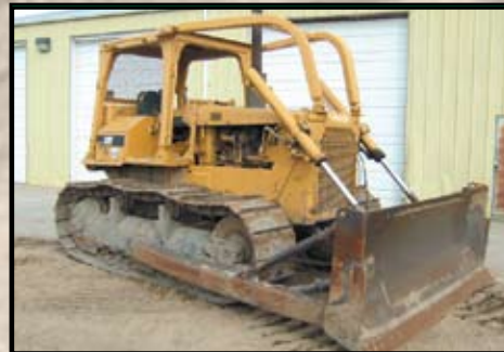
CATERPILLAR D6D CRAWLER/ DOZER