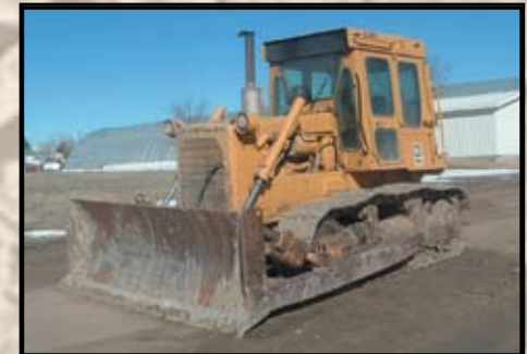
CATERPILLAR D6D CRAWLER/ DOZER W/ CAB