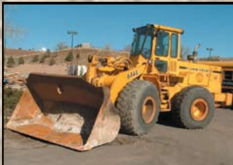
1992 JOHN DEERE 644E WHEEL LOADER, COUNTY MACHINE