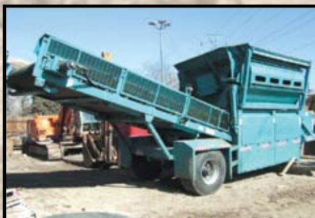
2006 POWER SCREEN POWER GRID800 W/ 1400 HRS.