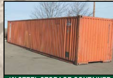
40' STEEL STORAGE CONTAINER, (1 OF 4)