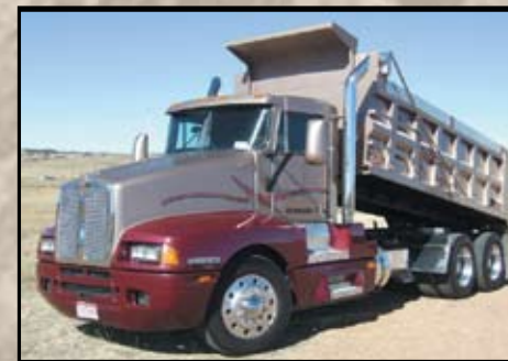
1995 KENWORTH T600 DUMP TRUCK W/ DETROIT

2007 Kalyn Siebert 40-Ton Step Deck Trailer, 48' x 102", Spread Axle 2005 Fontaine Specialized 35-Ton Lowboy Trailer, 48' By 102", Set Up For Flip 3rd Axle, 29' 2" In Well, Air Ride 1999 Trail King TK70SA-48 Hydraulic Tail Trailer, 48' Overall Length, Pony Motor, 87260 lb. GVWR, Braden Winch 1993 Transcraft Flatbed Trailer, 48' By 96" Wide, Air Ride, Spread Axle, Sliding Winches 1984 Great Dane 42' Flatbed Trailer Fontaine Step Deck Trailer Timpte 42' Flatbed Trailer