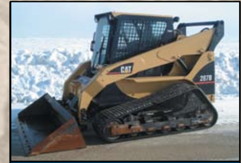
2004 CATERPILLAR 287B TRACK SKID STEER LOADER