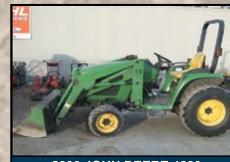
2000 JOHN DEERE 4200 TRACTOR/ LOADER, (1 OF 2)