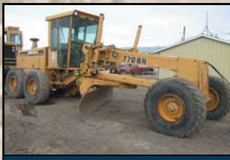
JOHN DEERE 770BH MOTOR GRADER, EX COUNTY