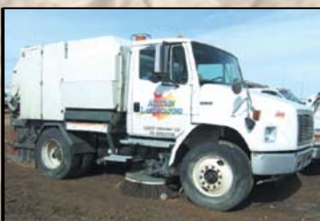
2004 ELGIN BROOM BEAR STREET SWEEPER