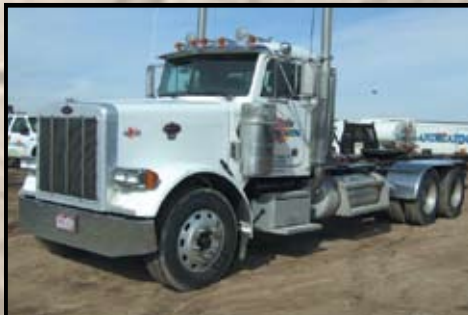
2004 PETERBILT 379 TRUCK TRACTOR W/ CAT C15