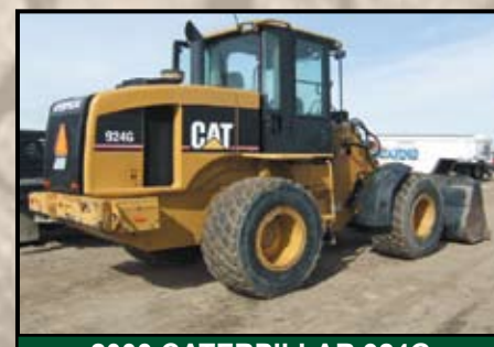
2003 CATERPILLAR 924G WHEEL LOADER