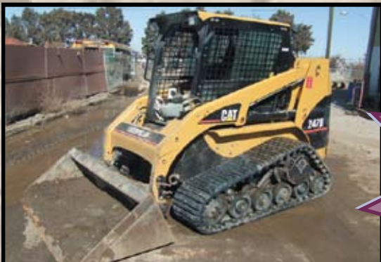
2006 CATERPILLAR 247B SKID STEER LOADER W/ 971 HRS.