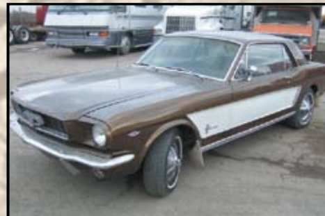
1965 FORD MUSTANG W/ 289