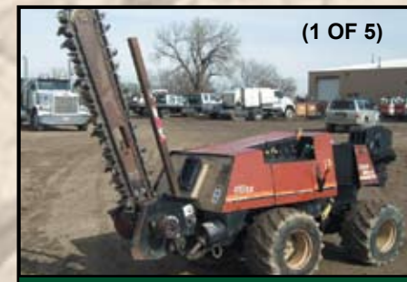
DITCHWITCH 410SX CABLE PULLER W/ TRENCHER & ROTOWITCH (1 OF 5)