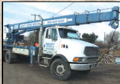
2001 STERLING W/ MANITOWOC 28-TON CRANE