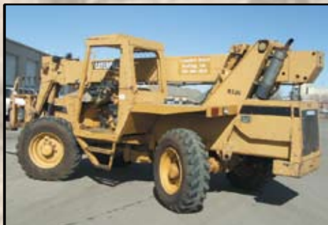
CATERPILLAR 8000 LB. REACH FORKLIFT