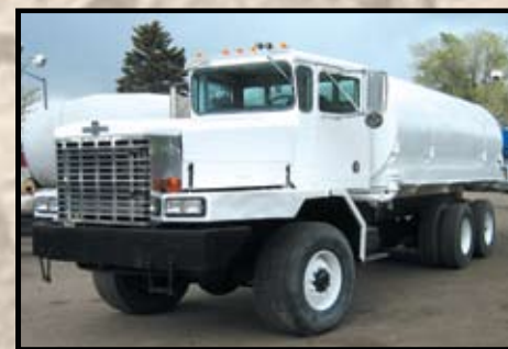
1995 OSHKOSH 4500 GALLON WATER TRUCK