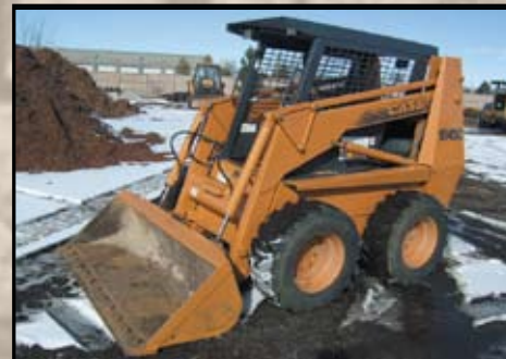
2000 CASE 1845C SKID STEER LOADER