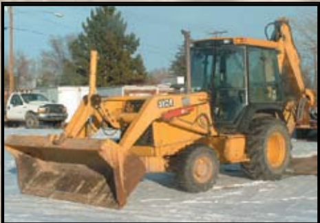
1998 JOHN DEERE 310E 4WD BACKHOE/ LOADER