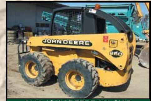
2000 JOHN DEERE 260 SKID STEER LOADER