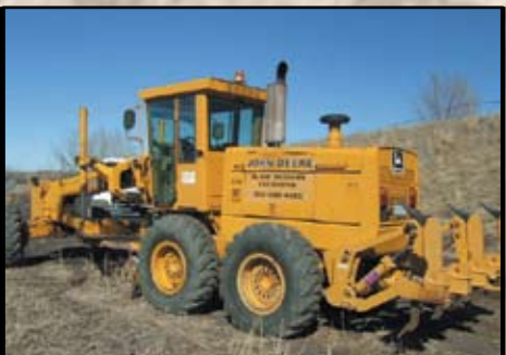
JOHN DEERE 770BH MOTOR GRADER W/ RIPPER