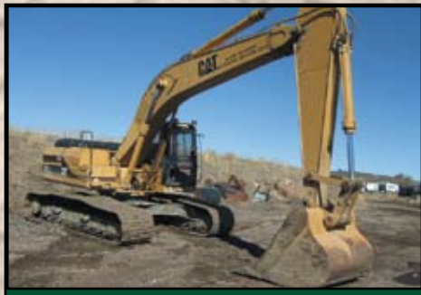
CATERPILLAR 322L HYDRAULIC EXCAVATOR