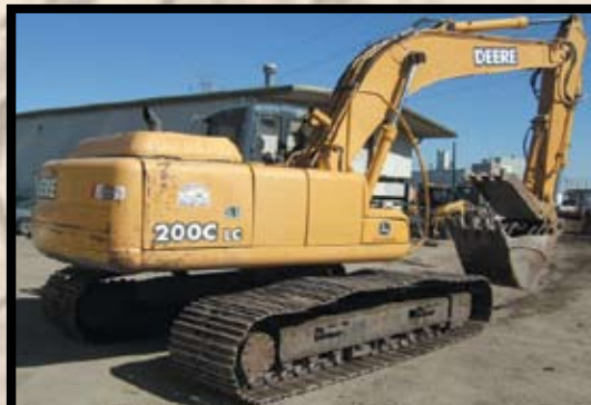
2002 JOHN DEERE 200C-LC HYDRAULIC EXCAVATOR