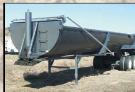
35' ROCK TRAILER