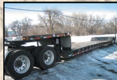
2005 FONTAINE 35-TON LOWBOY TRAILER