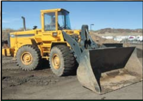
1997 VOLVO L90C WHEEL LOADER