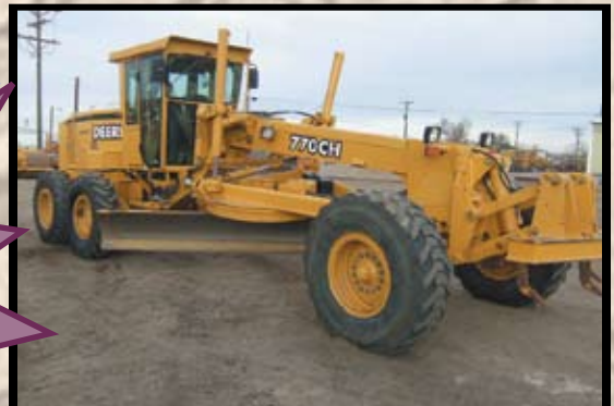
2000 JOHN DEERE 770CH MOTOR GRADER, EX COUNTY