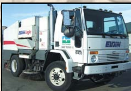
2001 ELGIN EAGLE STREET SWEEPER, CITY UNIT