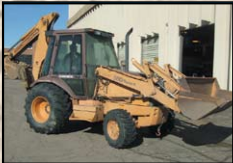
CASE 580 SUPER K 4WD BACKHOE/ LOADER