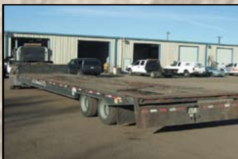
1999 TRAIL KING 48' HYDRAULIC TAIL TRAILER