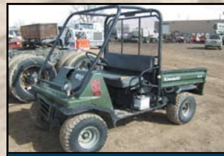
KAWASAKI MULE 2510 TRUCKSTER, 4WD, (1 OF 2)