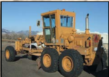
KOMATSU GD505A-2 MOTOR GRADER, CITY UNIT