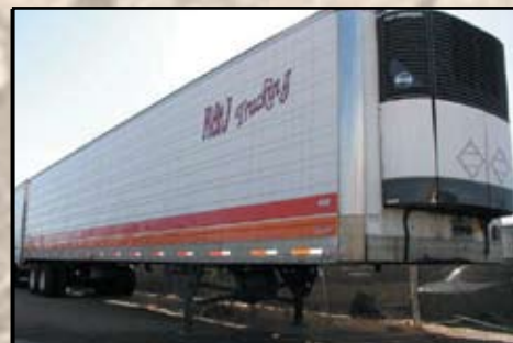
UTILITY 48' TRAILER W/ CARRIER REEFER UNIT