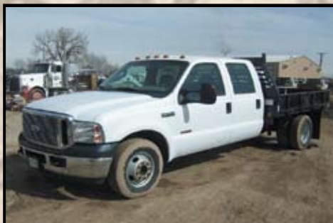
2006 FORD F350XL FLATBED TRUCK W/ POWER STROKE, (1 OF 5)