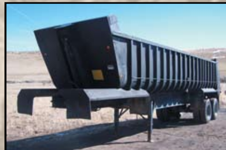
HOBBS STEEL END DUMP TRAILER, FRAME TYPE