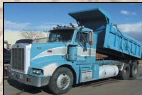
PETERBILT 377 DUMPTRUCK W/ 425 CAT