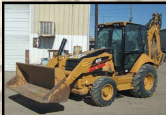
2006 CATERPILLAR 420E BACKHOE/ LOADER W/ 781 HRS.