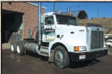
PETERBILT 377 TRUCK TRACTOR W/ 425 CAT