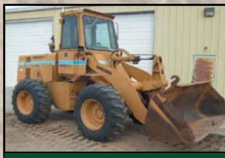
DRESSER 510 WHEEL LOADER