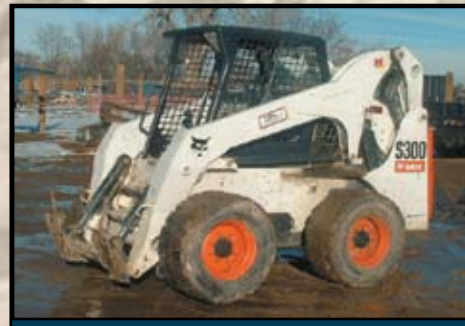
2003 BOBCAT S300 SKID STEER LOADER