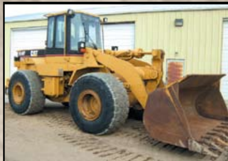
CATERPILLAR 950F WHEEL LOADER

2000 John Deere 770CH Motor Grader, 14' Moldboard, 14.00-R24 Tires, Ex County Machine, s/n DW770CH575394 John Deere 770BH Motor Grader, 14.000-R24 Tires, Ex County, s/n DW770BH542107 1987 John Deere 770BH Motor Grader, 14' Moldboard, Rear Ripper, 14.00-24 Tires, s/n DW770BH513173 1984 Komatsu GD505A-2 Motor Grader, Cab, Heat, A/C, 14' Moldboard, 5475 Hrs, County Unit, s/n 60060 Caterpillar 112 Motor Grader, Pony Motor, 13.00-24 Tires, 12' Moldboard, s/n 3U2382 Allis Chalmers M100B Motor Grader, Front Scarifier, 14' Moldboard, 14.00-24 Tires, s/n 1650