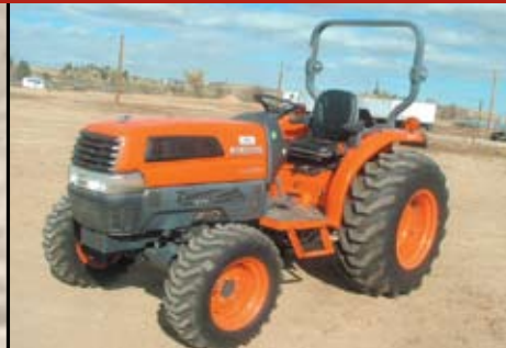
2006 KUBOTA L4330 TRACTOR, 4WD

1984 International Floater 4030 4WD, Cummins VT903A, Allison Automatic, Rear & Side Discharge, Tank Capacity Of 3000 Gallons, Vacuum Pressure Pump, 66x 43.00-25 Tires, (1) Extra Tire, City Unit