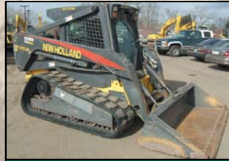
2005 NEW HOLLAND LT185.B TRACK SKID STEER LOADER