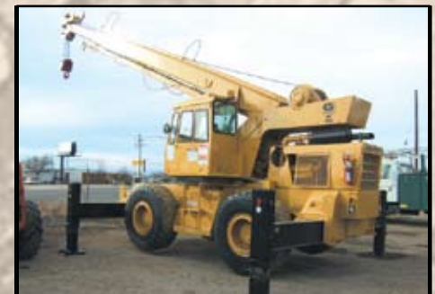
GROVE RT60S ROUGH TERRAIN CRANE