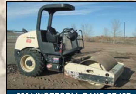
2004 INGERSOLL RAND SD45D RIDE-ON ASPHALT ROLLER