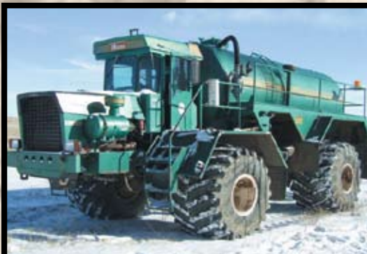
INTERNATIONAL FLOATER 4030, 4WD, W/ CUMMINS