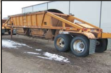
SPARTAN BELLY DUMP TRAILER, DBL. GATE, (1 OF 2)