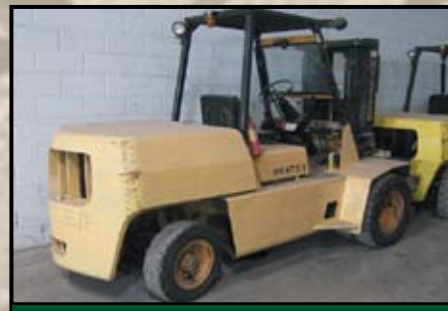
HYSTER 10,000 LB. DIESEL FORKLIFT