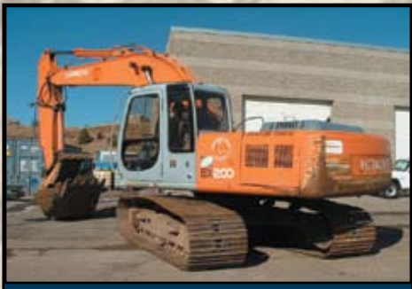
1997 HITACHI EX200-5 HYDRAULIC EXCAVATOR, COUNTY MACHINE