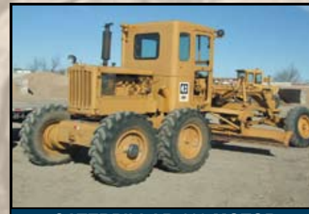
CATERPILLAR 112 MOTOR GRADER W/ PONY MOTOR