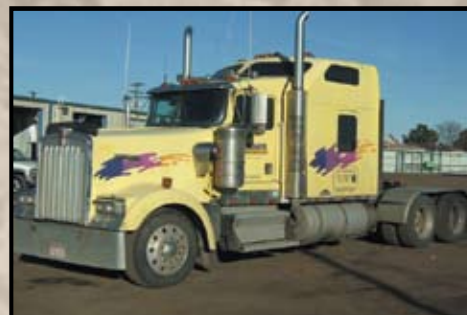
2000 KENWORTH W900B TRUCK TRACTOR W/ DETROIT