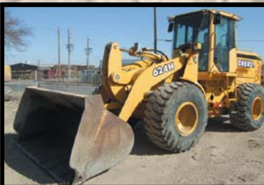
1999 JOHN DEERE 624H WHEEL LOADER